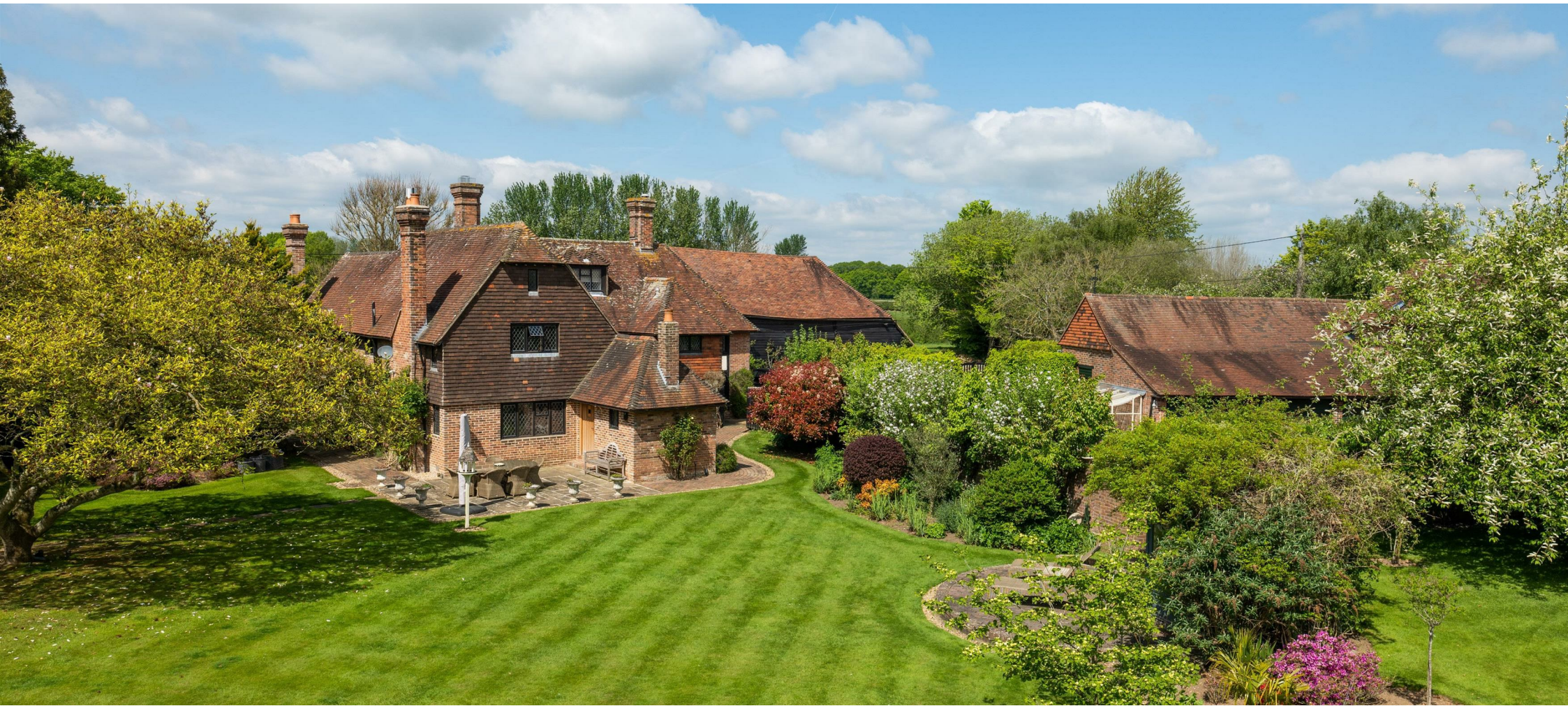
Sharpsbridge Lane, Piltdown